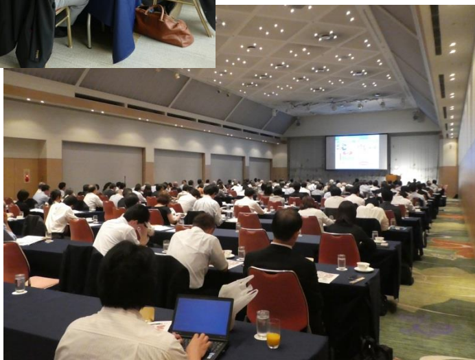
Summer Conference (Karuizawa, 2017)